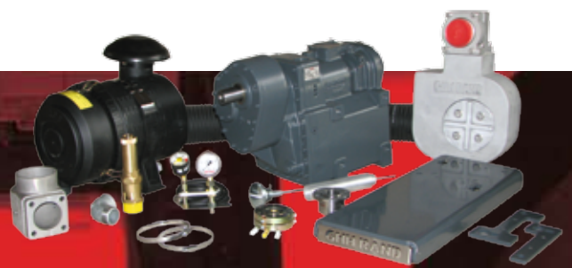
In Chassis Solution